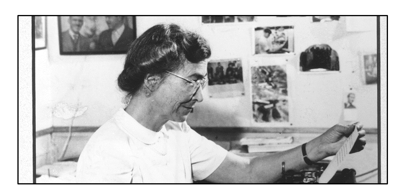
Working at the Pilot