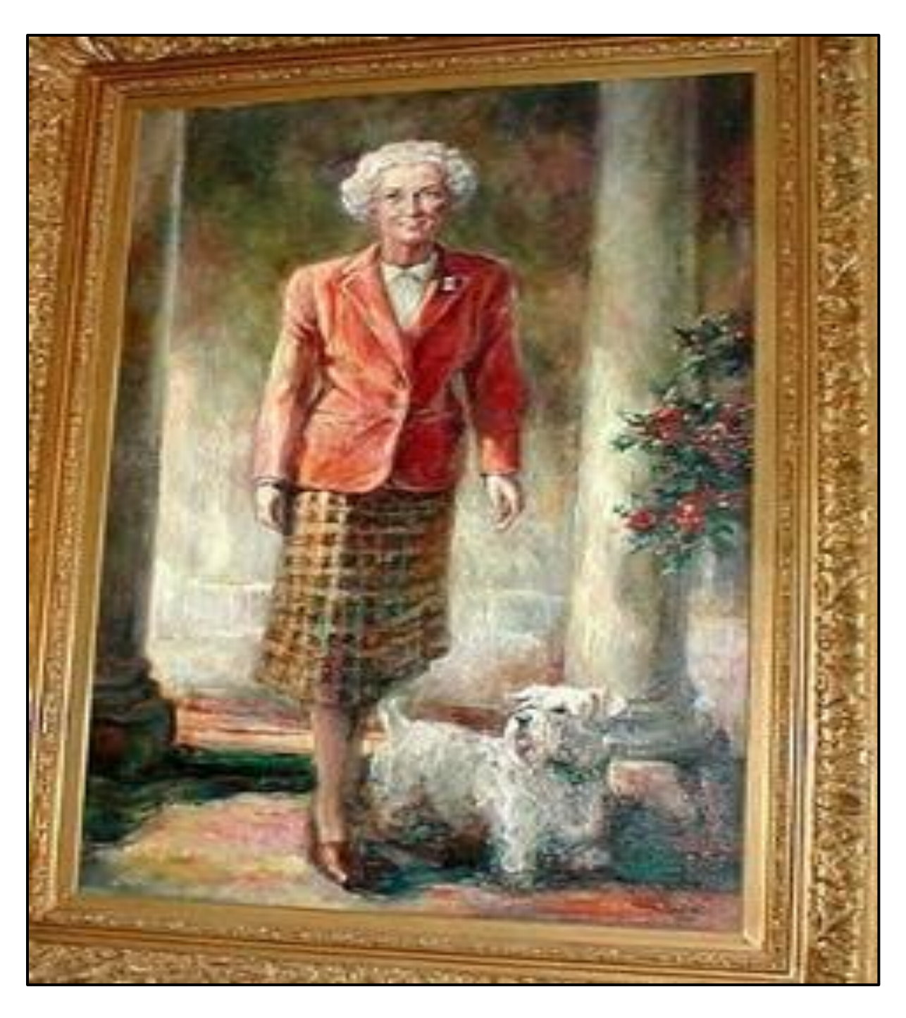
Portrait at Weymouth Center